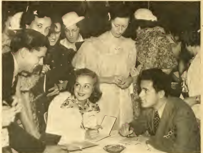
Last year members of the Movieland Tour parties were given many a close-up of the stars. Here are a few being given autographs by Anne Shirley and Johnny Downs