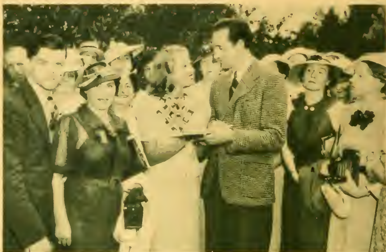
Here are a few of those who attended the house party at Paula Stone's home as part of the 1936 Fawcett Movieland Tour festivities. Miss Stone and Basil Rathbone are shown in center. Similar parties will be available to those who register for the 1937 Movieland Tours

And what a vacation! Starting your two-weeks' vacation in Chicago, you whisk through the silvery beauty of Min-