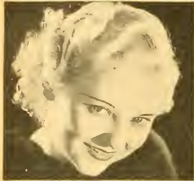
Posed by professional model.

You Keep the Brilliance, Lustre and Loveliness this New Shampoo Gives Hair—FOR A WHOLE WEEK!