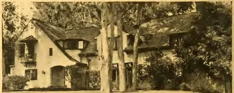
The lovely Hollywood home of Fay Wray, who will be hostess to guests of the second Movieland tour

If you want to see exactly what goes on inside the studios, if you would like to eat with them in the studio commis-