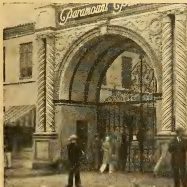
The Movieland Tour will give you the key to this gate, which leads to the home of Paramount pictures

On Sunday afternoon a tour of Hollywood will give you an opportunity to view the famous night clubs of the entertainment capital. The trip will take you through the swanky residential districts where the homes of the stars are located. Late the same afternoon Basil [Continued on page 70]